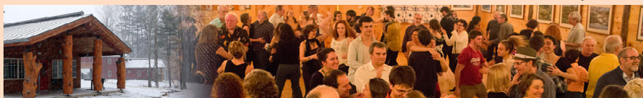
The Ashokan Center's New Year's Eve Dance & Dinner Party